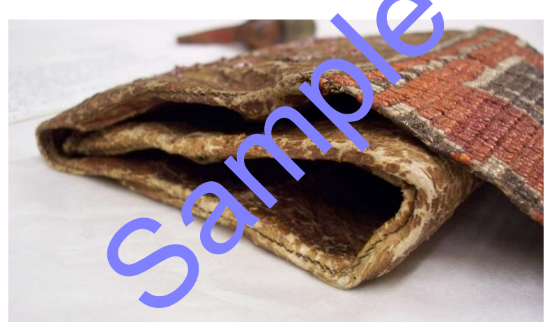
Figure 1. A side view of the Bancker bag showing the side seam and folds. Museum of the City of New York. 48.250.1AB.

I will refer to this type of bag as a "quill-netted panel bag" or in a more general term for tobacco bag which I will explain further in the paper as a "Petunk". Quill-netted panel bags are characterized by thin cords of animal leather or natural fiber along the bottom edge of a rectangular two-piece flat bag. These bottom edge fringes are quill-wrapped in pairs and then in subsequent rows, the cords are quill-wrapped pairs of alternating fringe cords. This creates a "netted" lattice by which changing colors reveals the pattern. The designs then can be rendered along a diagonal grid framework. The wrapping technique is a simple friction-rendered wrapping but requires great spatial consistency as well as a very experienced 'hand' to execute the complicated tight patterns. The technique can be very tightly rendered or somewhat loose depending on the maker.